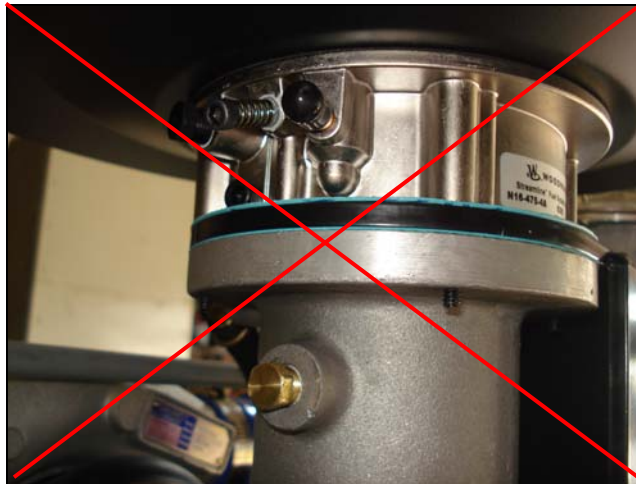
Figure 1 - Without Vacuum Hose.

From this point forward, all 8.1L NG & LPV TURBO engines must have a vacuum hose running from the power valve vacuum port on the mixer to the bung directly below the mixer. Use pipe dope when installing the hose barb in the bung.