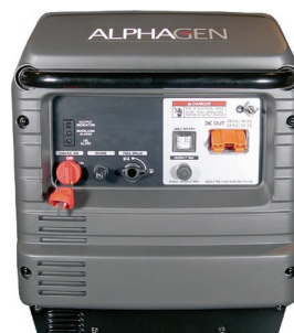
AlphaGen front view