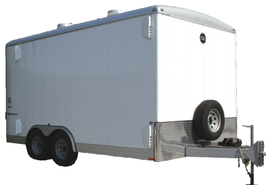
AlphaGen Portable Trailer

For more information visit www.alpha.com