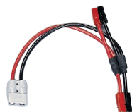
Y-Adaptor Battery P/N 874-946-22