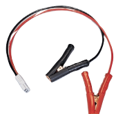
Alligator Clamp Battery Interface P/N 874-946-20