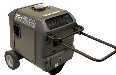
AlphaGen with optional Wheel Kit and Locking Handle