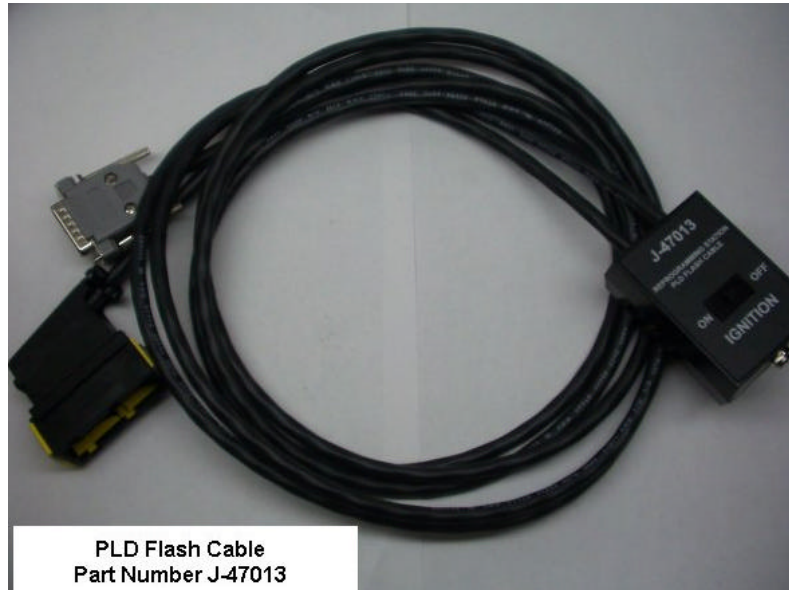
PLD Flash Cable Part Number J-47013