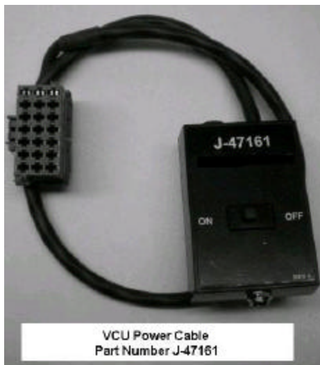
VCU Power Cable Part Number J-47161