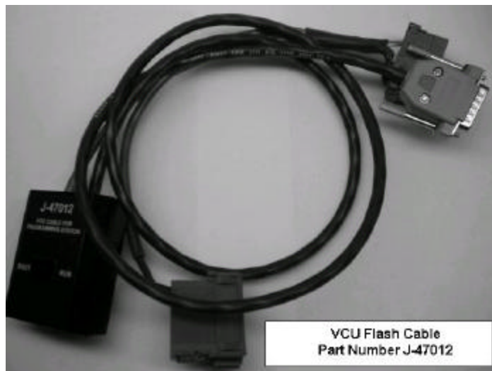
VCU Flash Cable Part Number J-47012

This kit will be available beginning March 19th, 2004 in anticipation of the production release of DRS 5.0 in April 2004. To obtain an MBE PLD / VCU programming kit, simply fill out the order form at the end of this letter and fax it to the number indicated. Both the PLD flash cable and the VCU power cable need to be powered up by an external power adapter. All Programming Stations ordered over the past five years have contained a 12-volt AC adapter (p/n J-42767). Both the PLD flash cable and VCU power cable can use this adapter. Users with the older style suitcase programming station can order the AC adapter from SPX (1-800-328-6657). For further information please contact the Reprogramming Station Support Team at 313-592-5959.