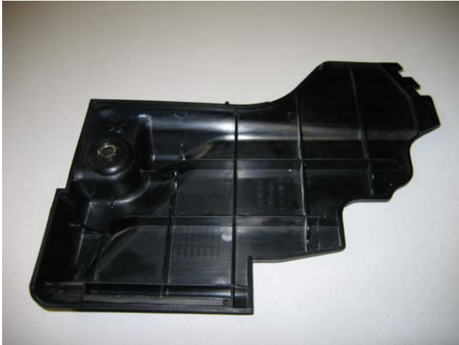
Figure 1 Rear Engine Cover (Stock)