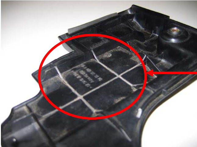
Figure 2 Rear Engine Cover (Modified)