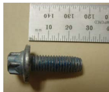
Self tapping bolt for CTV Cover plate 2 (P/N: 000000001140)