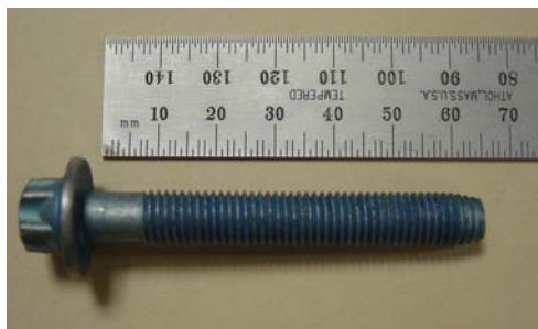
Self tapping bolt with use of CTV solenoid 2 (P/N: 000000001535)

CTV Cover Plate available separately, P/N: 9060110032.