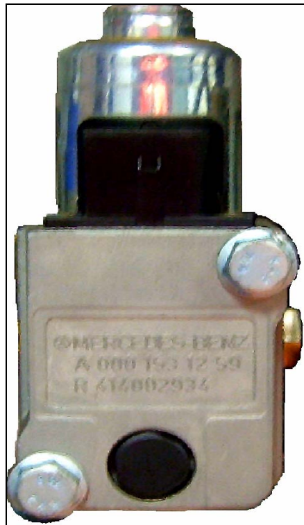
Figure 2 – VPOD with the breather cavity exposed